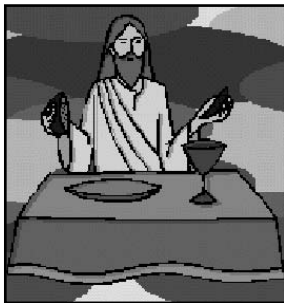
He had been made known to them in the breaking of the bread. (Luke 24:35)