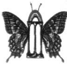
Athens Area Chrysalis