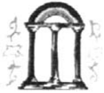
Athens Area Emmaus

Nonprofit Organization U.S. Postage PAID Athens, Georgia Permit No. 268