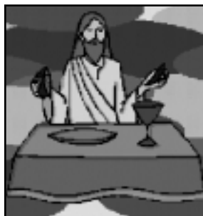
He had been made known to them in the breaking of the bread. (Luke 24:35)