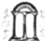
Athens Area Emmaus

Nonprofit Organization U.S. Postage PAID Athens, Georgia Permit No. 268