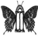
Athens Area Chrysalis