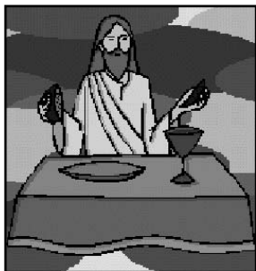
He had been made known to them in the breaking of the bread. (Luke 24:35)