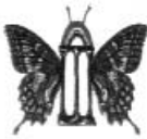
Athens Area Chrysalis